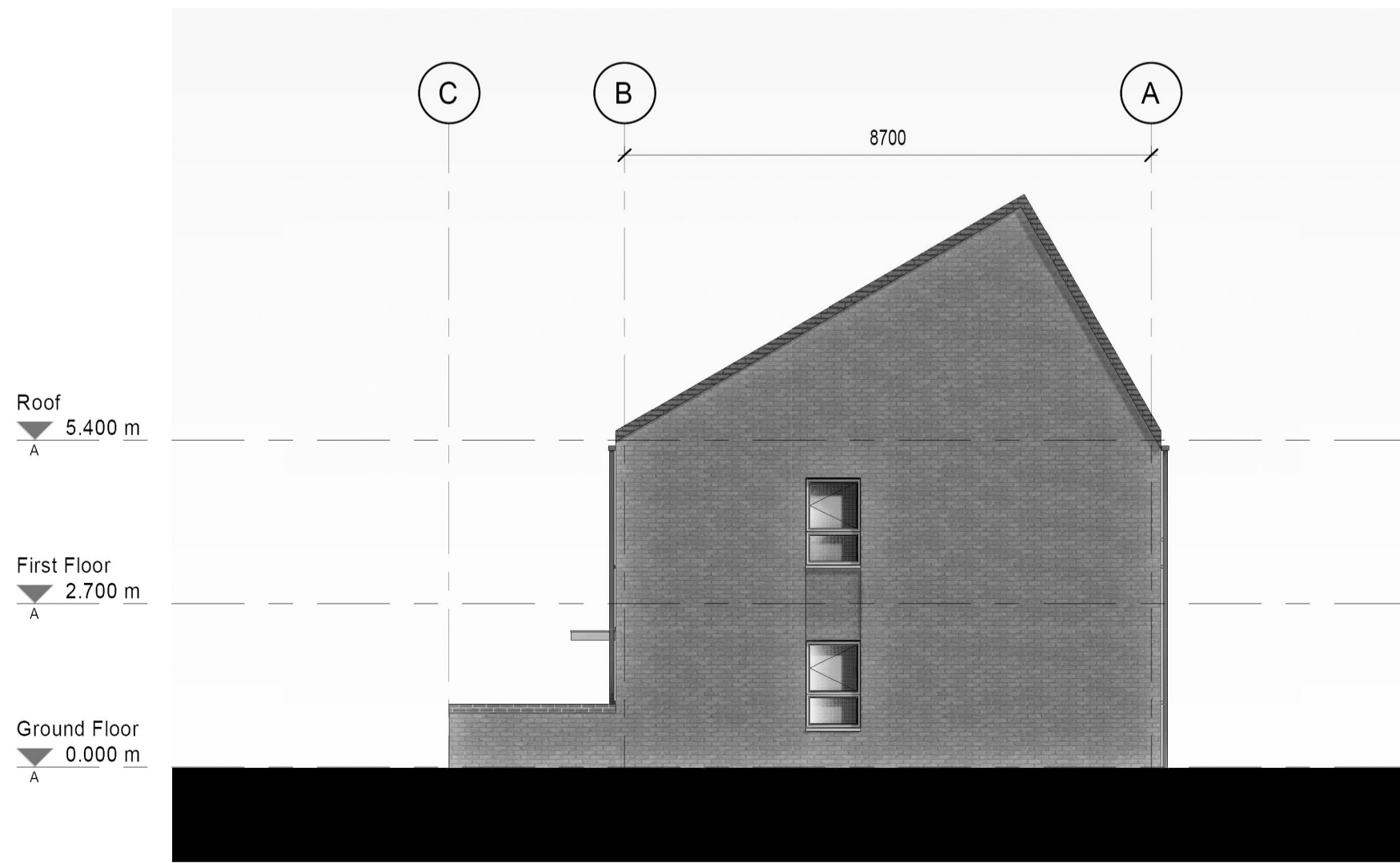
3 SOUTH-EAST ELEVATION 1 : 100

AHR Architects Ltd First Floor Victoria Quay Shrewsbury SY1 1HH United Kingdom T +44(0)1743 283000 F +44(0)1743 232117 E shrewsbury@ahr.co.uk www.ahr.co.uk