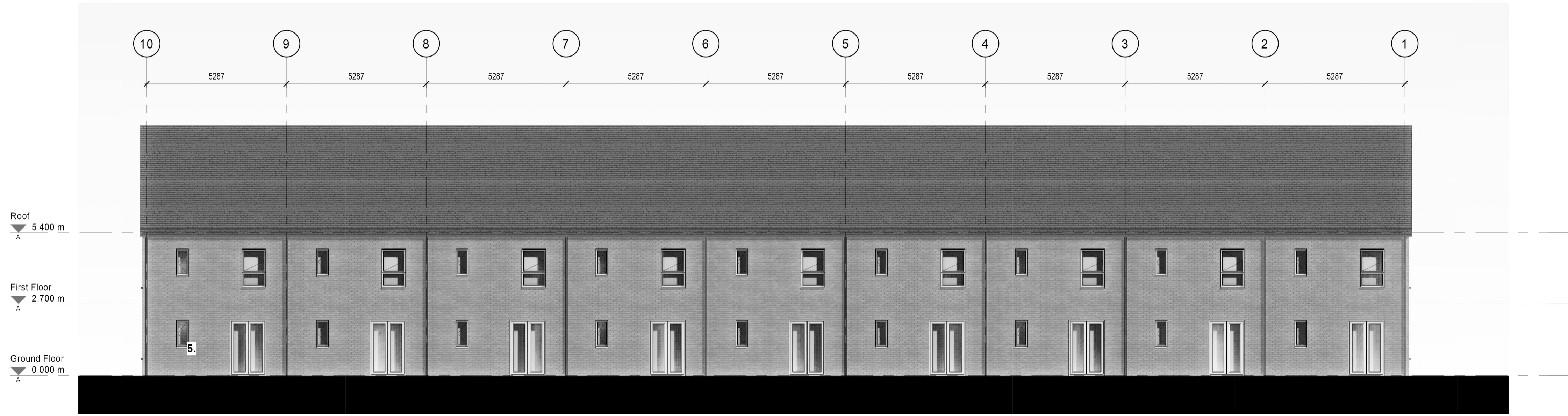
2 NORTH-EAST ELEVATION 1 : 100

Note: Brick garden walls to boundary gable and garden ends with timber division fences.