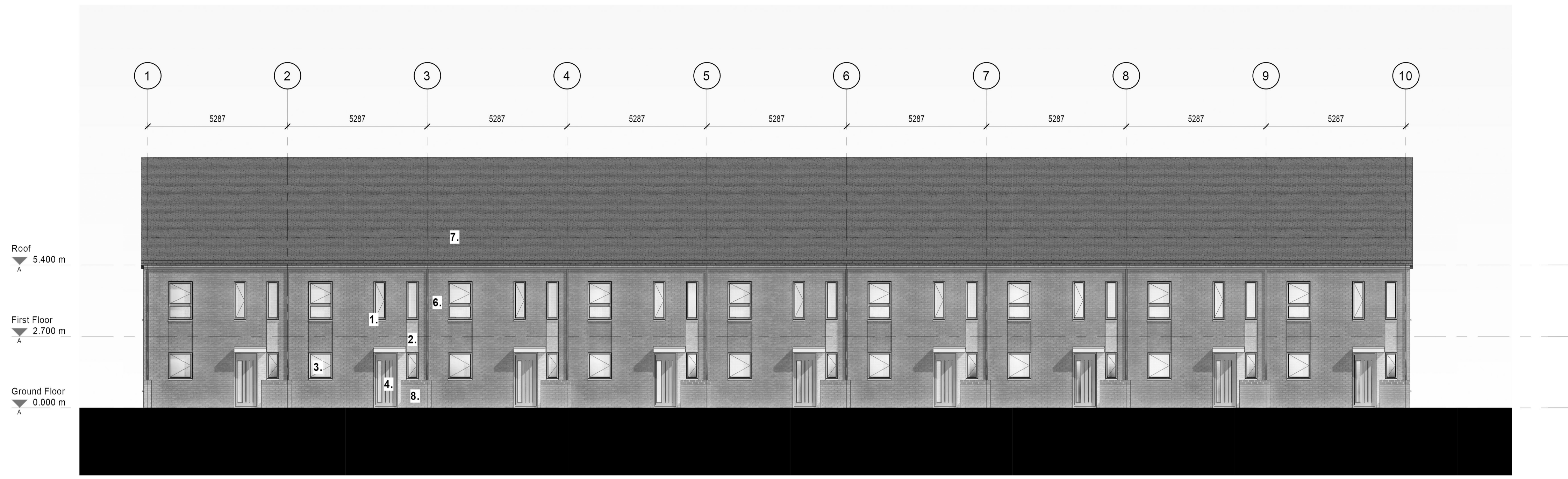
1 SOUTH-WEST ELEVATION 1 : 100